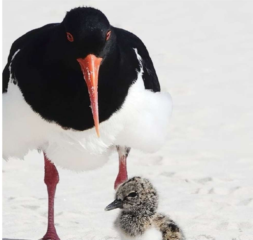
Belongil POC Pair 3 Hatched 6.10.23