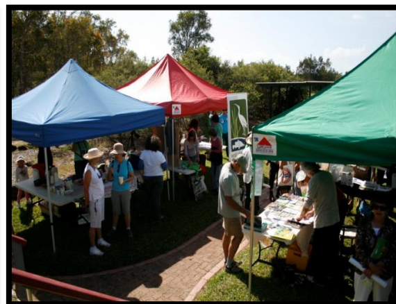
Wild About Birds t-shirts released at the 2011 BBB field day and some of the store holders.