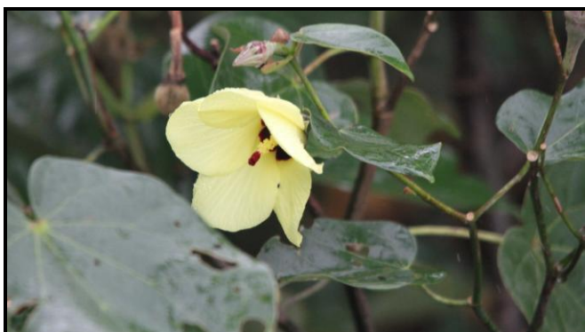
The coastal hibiscus, Hibiscus tiliaceus , is a common tree found in coastal areas.

The reserve also hosts migratory shorebirds such as the bar-tailed godwit, below. These birds travel thousands of kilometres (without stopping!) from their home in the northern hemisphere to spend the summer in Ballina. They can be found gracing our shores from around September to April.