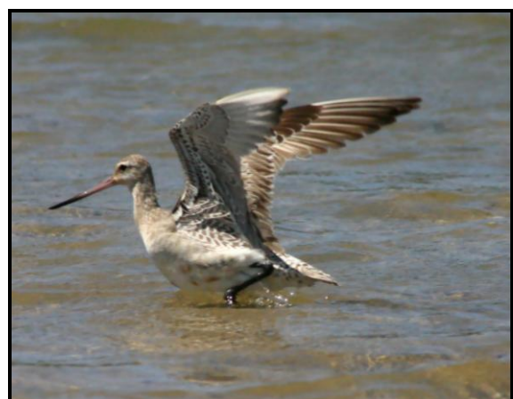
A bar-tailed godwit, Limosa lapponica, relaxes at East Ballina before making the long journey back home to the northern hemisphere.